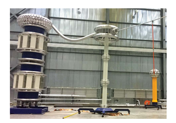
800 kV series resonant test system performing an AC withstand test on a live line working tool.