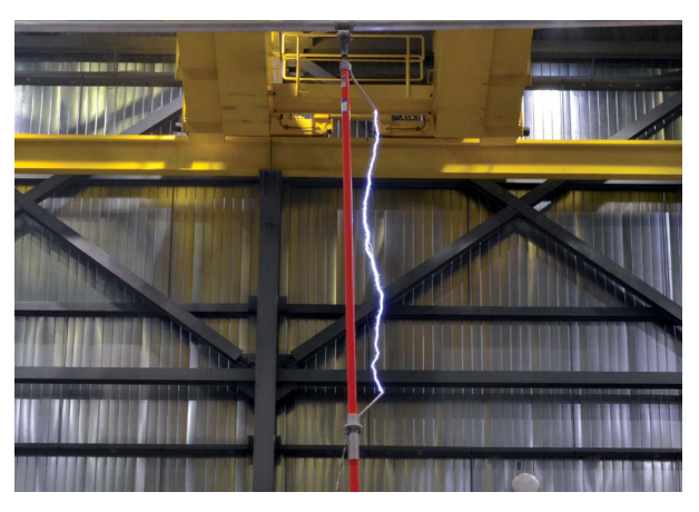
Switching impulse tests performed on a protective gap tool rated for 500 kV live line work.